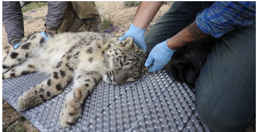
Fig. 2. An anaesthetised female snow leopard examined by biologists. The animal had been trapped illegally in a snare, recovered and kept captive for 18 months before being fitted with a GPS collar and released back into the wild. Eastern Pamirs, Tajikistan.