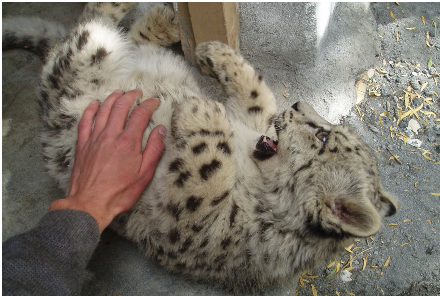
Fig. 1. A snow leopard cub rehabilitated in Gilgit-Baltistan, Pakistan. The animal named "Leo" was eventually sent to the Bronx Zoo, New York (Photo Anonymous but collected by Mayoor Khan/WCS).

near the ceiling is essential to provide respiratory comfort. Contacts with other animals, either direct or indirect (e.g. through objects, clothing or footwear), particularly with domestic carnivores, must be avoided, and the keeper should minimise contacts with pets, which may be clinically healthy but not necessarily pathogen-free. Visits should be minimised, and if unavoidable should be timed to coincide with a "normal visit", such as for feeding. Last, captivity period should be kept as short as possible and all early husbandry measures should be designed to decrease imprinting of the rehabilitated animals to human beings and to human environment, enabling whenever possible a quick return to the wild (Fig. 2).